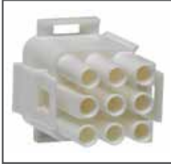
Crimp Housing Plug