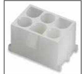
Vertical Polarization Header in Glow Wire Compliant Material