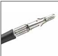
Split Pin Male Crimp Terminal