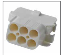
Pin and Socket Receptacle