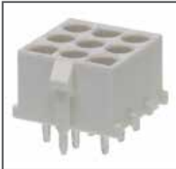
Vertical Polarization Header