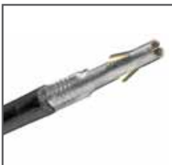
Socket Female Crimp Terminal