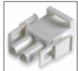
Crimp Housing Plug